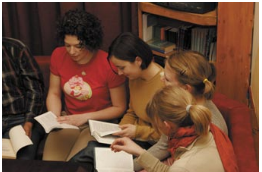
A Bible study with a number of guests.

Part of traveling is that you discover new things. Most of our guests, therefore, are open to new ideas and impressions. Will they only be affected by what the city has to offer or will they leave Amsterdam being influenced by our Christian witness as well?