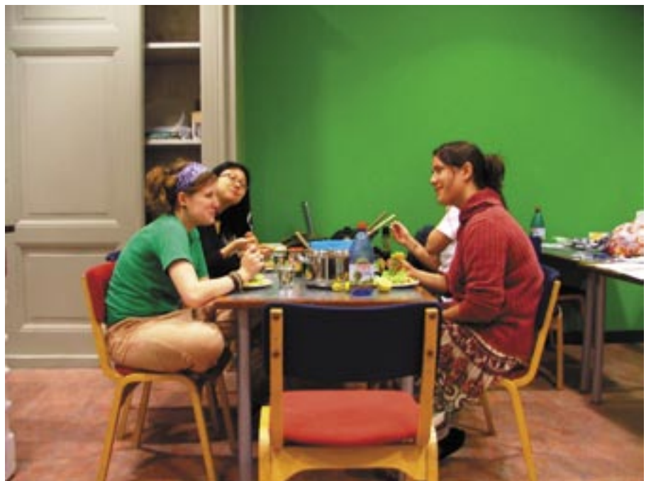
Sharing a meal together.

The team community is important to create unity, build healthy mutual relationships, and provide support, rest and spiritual refreshment. It also teaches our workers to grow relationships with other Christians and to value each others gifts and personalities.