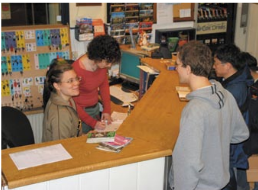
We have welcomed travelers since 1971.

The Shelter Youth Hostel Ministry is a Christian ministry to travelers. In the city centre of Amsterdam, the Netherlands, we run two Christian youth hostels: The Shelter City and The Shelter Jordan.